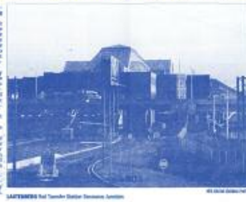
LAUTNER/Red Transfer Station Secaucus Junction